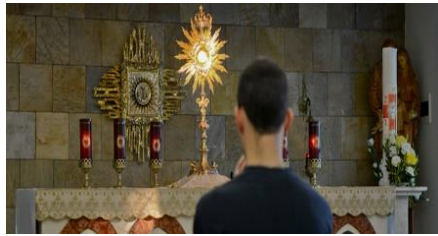
Sacred Heart/St. Dominic Chapel , Portland .