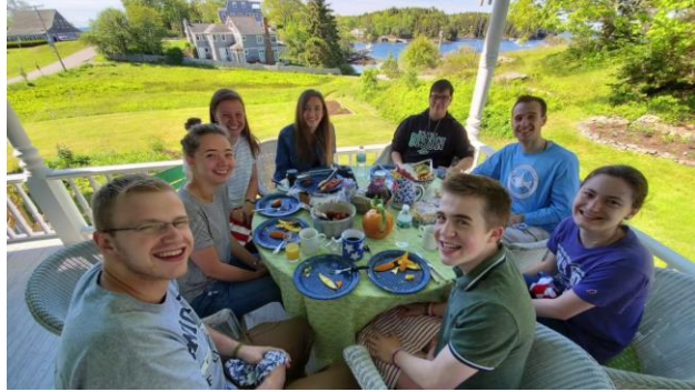
4 - Video from 2019. A foreshadowing of the fun that's to come this summer.