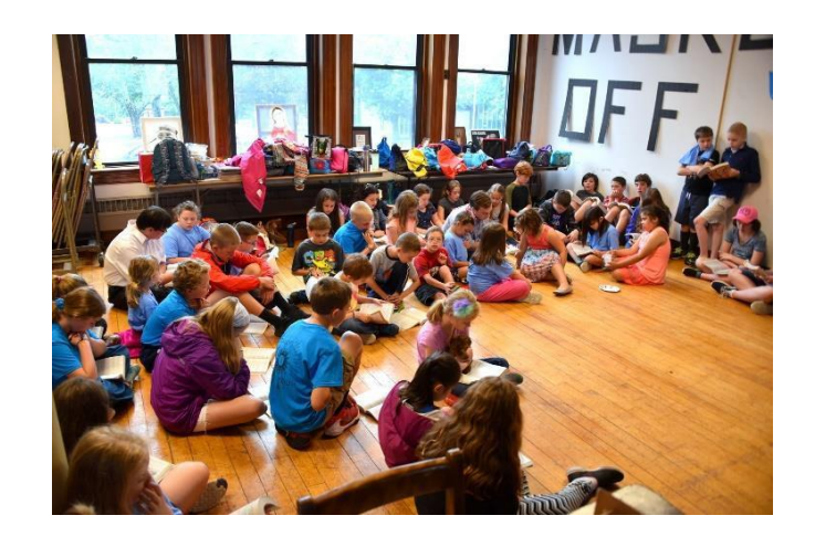
1^{\text{ST}} - 8^{\text{TH}} Grade Program

The Totus Tuus morning and afternoon program is designed for children going into 1<sup>st</sup> - 8<sup>th</sup> grades in the 2022-2023 school year. This program runs Monday through Friday.