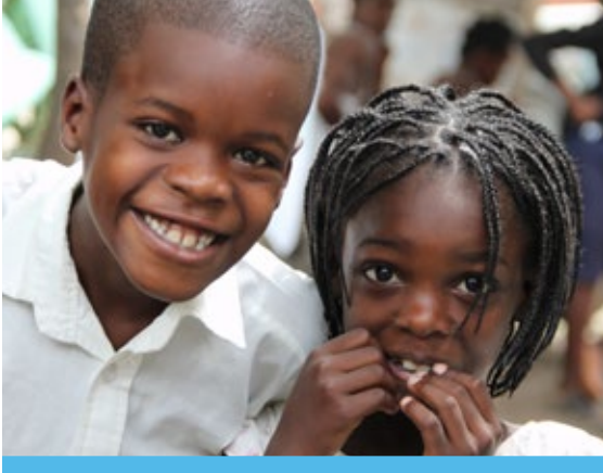
Children play during a community-run mother's club meeting. Bottom: A girl attends a graduation ceremony for mothers who have learned about preventing malnutrition in young children through an educational program.

Call to Family, Community and Participation is one of the Seven Themes of Catholic Social Teaching as outlined by the United States Conference of Catholic Bishops, or USCCB. Catholics believe that every human life is sacred and should be respected from conception until natural death. We also believe that human life is inherently social, and that how we relate to each other in society impacts human dignity and our ability to grow in community (Seven Themes of Catholic Social Teaching) USCCB. Marriage and family are foundational communities of society. In the Acts of the Apostles, St. Paul describes what community looks like: Disciples of Christ shared their food and possessions to make sure the neediest among them were taken care of (Acts 2:42-47). These members of the early Church model a society in which all members of a community care for one another.